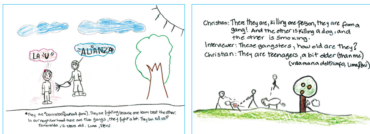
Figure 3 – Children's accounts of violent situations in an urban community