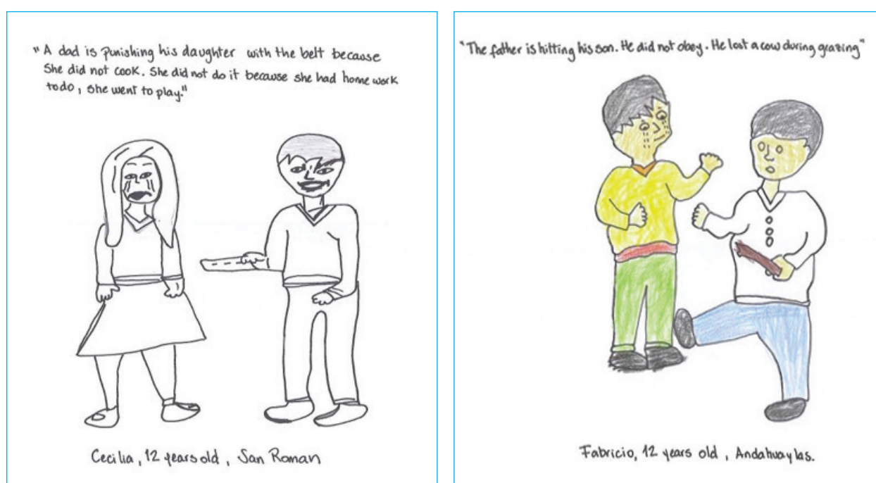
Figure 2 – Failure to fulfil domestic chores and responsibilities: The most common trigger for violence at home