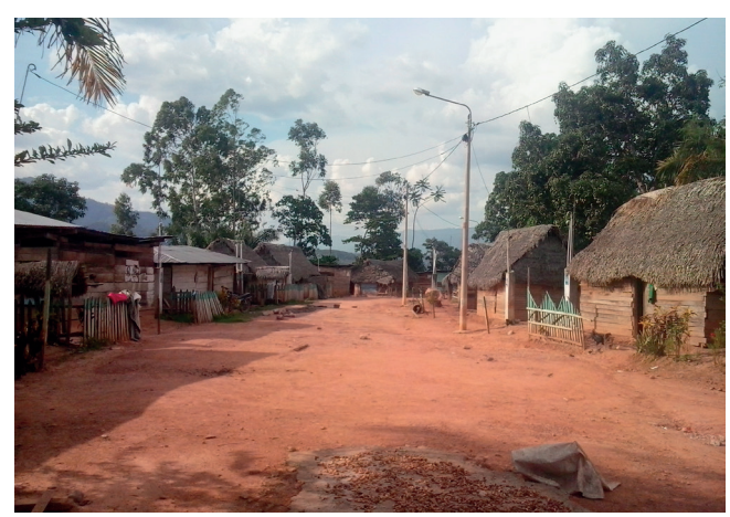
Main street of a rural village in the central Amazon rainforest of Peru

This fact sheet presents preliminary findings from the fourth round of the Young Lives survey in Peru in 2013. It reports on some of the changes that have taken place in household poverty levels over the eleven years since we first interviewed the study children in 2002. The data show a meaningful improvement in living standards of the children's families. While gaps in welfare-related outcomes persist, these have reduced over time, in some cases substantially. Progress can probably be explained by economic growth, improvements in the coverage of basic services, social programmes and geographical mobility. At the same time, we identify areas in which disadvantaged groups still lag behind. The challenges ahead for policymakers involve working not only to close the persisting inequalities in coverage and access to services, but also to improve efforts to reduce gaps in the quality of the services received by the poorest households.