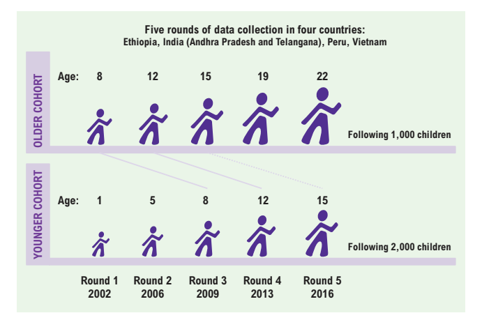
Figure 1. Young Lives longitudinal and cohort study

Four rounds of quantitative surveys of children, households and communities have been conducted in Ethiopia. The first round was carried out between October and December 2002 when the children were aged around 1 year and 8 years. The following surveys have always been carried out at the same time of year in 2006 (Round 2), 2009 (Round 3), and 2013 (Round 4) – when the children were aged between 11 and 12 years (the Younger Cohort) and between 18 and 19 years (the Older Cohort). The survey rounds have been interspersed with four rounds of qualitative data collection with a sub-sample of 50 of the children, resulting in a series of nested longitudinal case studies.