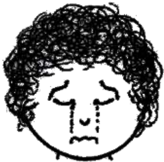
01= Strongly disagree

Fieldworker: Show Chart #3 with 5 faces, starting from "Strongly disagree" to "Strongly agree" and explain the meaning of answering each one. Say that in order to answer each question you must point out the face that best matches their answer