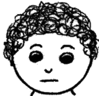
03= More or less