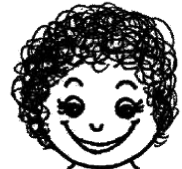
05= Strongly agree