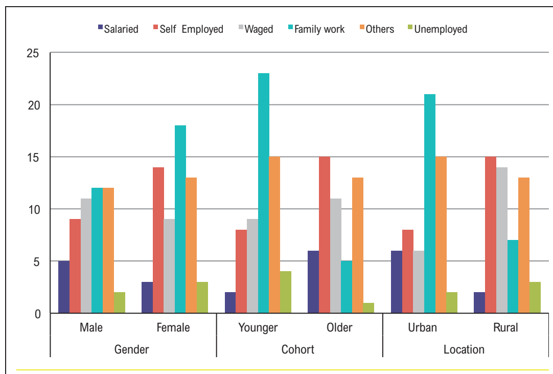
Figure 2. Employment type of young people aged 18 and 24 (2019) (N=122)