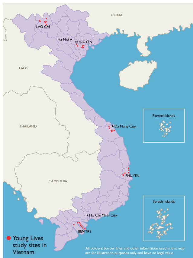
Figure 2. Young Lives study sites in Viet Nam

urban centres (Hanoi, Ho Chi Minh City, Da Nang, Hai Phong, and Ba Ria-Vung Tau) as another region – a 'Cities' region.